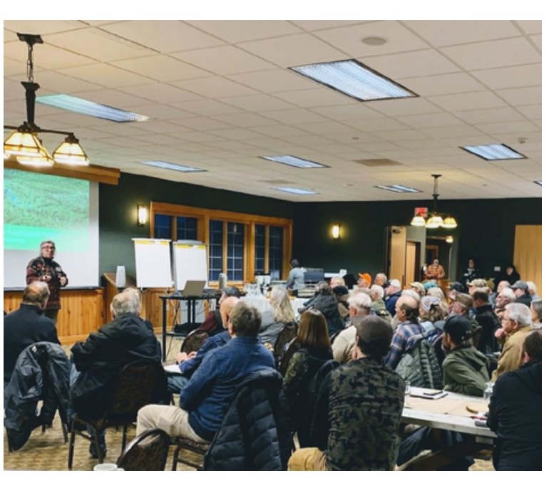
Public meeting for the Keweenaw Heartlands Project, January 2023