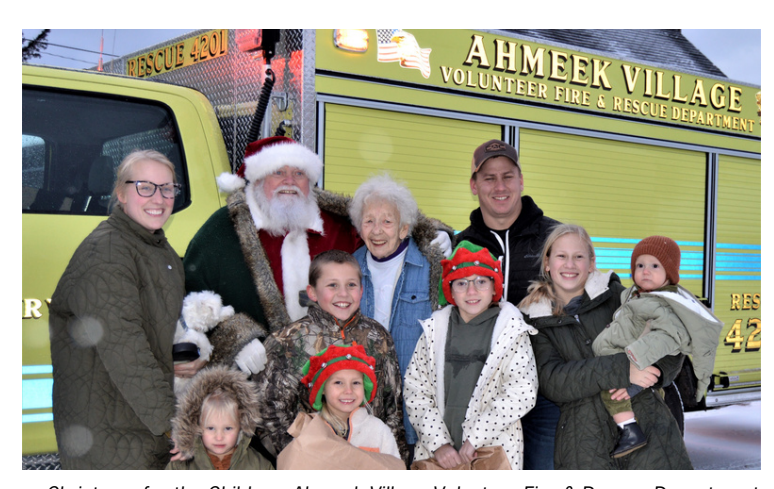
Christmas for the Children, Ahmeek Village Volunteer Fire & Rescue Department