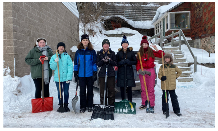
YAC members clearing snow and ice for community members during their winter 2023 community service day.

YAC awards grants to non-profit organizations and schools for youth-related programs in Houghton and Keweenaw counties. Members review applications, discuss, and vote as a group to make funding recommendations to the KCF board twice a year.