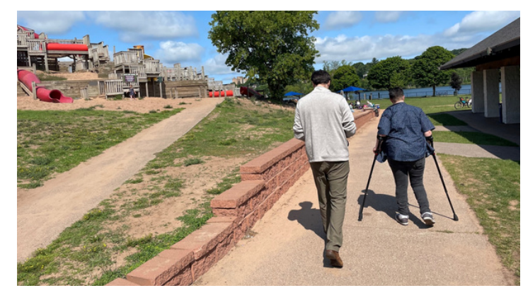
Accessible Keweenaw Initiative, accessibility site evaluations

Community-led effort to enhance access for all mobility levels to the Keweenaw's outdoors, cultural amenities and historical areas. The grant provided twenty local organizations free accessibility evaluations, to pave the way for future improvements.