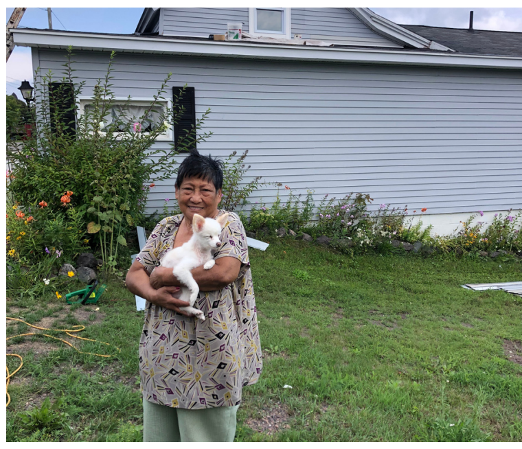
Grateful recipients of Let's Rebuild Community home updates, summer 2023

Working with our community partners to collaborate on shared goals for a thriving community.