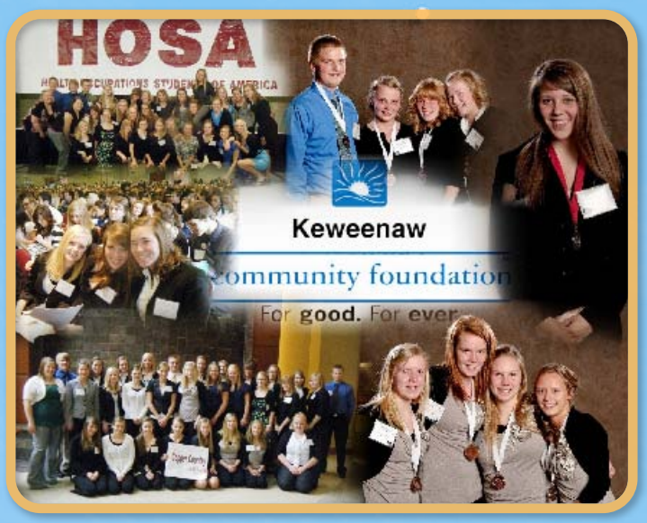
Some of the activities of the the Copper Country Intermediate School District HOSA (Health Occupation Students of America).