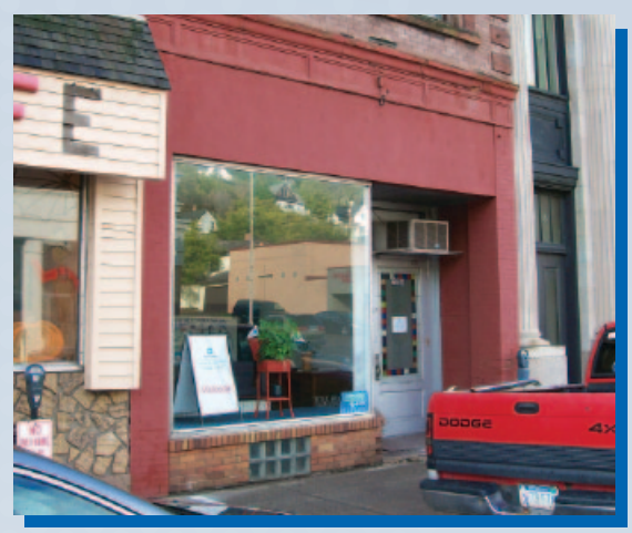
Last November KCF moved into its new home at 236 Quincy Street in Hancock. A new front wall design is in the works.

The Professional Advisory Council is professionally qualified to explore and offer advice to donors about tax and estate planning benefits, and to advise KCF and its partners about long-term financial investment and grant making policies. Your personal advisor can also assist you in selecting planned giving methods best suited for you and your charitable intentions.