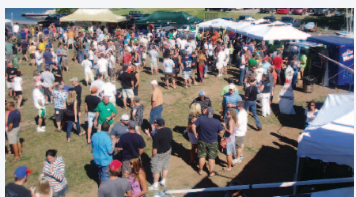
Hundreds of revelers enjoy Brewfest.