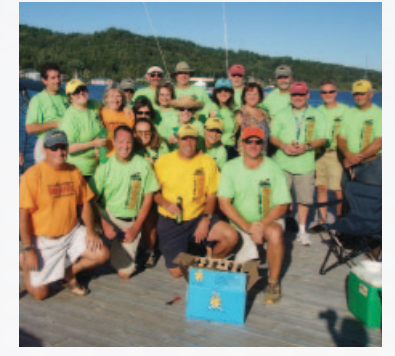
Brewfest volunteers celebrate a successful day.